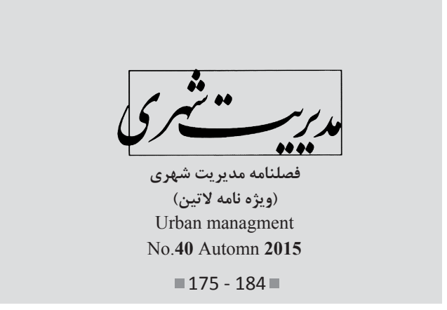
Received 26 Nov 2014; Accepted 17 Feb 2015