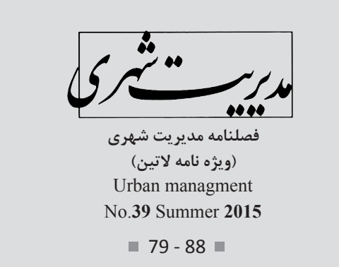
Received 23 Sep 2014; Accepted 11 Mar 2015