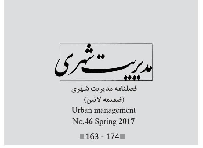
Received 23 Sep 2016; Accepted 11 Nov 2016