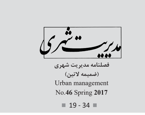
Received 4 Sep 2016; Accepted 28 Nov 2016