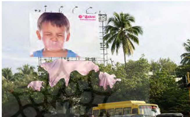
▲ Pic 2. Big Bobol Burst Chewing gum, Three-dimensional advertising (2007).