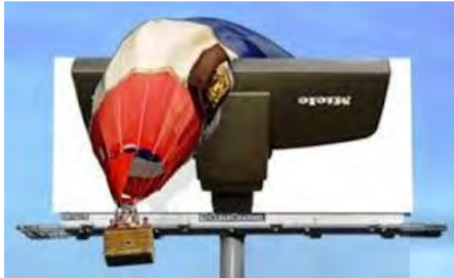
▲ Pic 1. Miele Vacuum cleaner. Three-dimensional advertising. (2011)