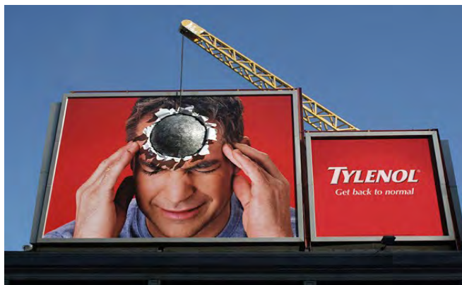
▲ Pic 4. Tylenol painkiller. Three-dimensional advertising. (2010).