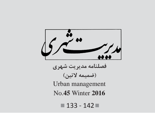
Received 12 Apr 2015; Accepted 28 Jul 2016