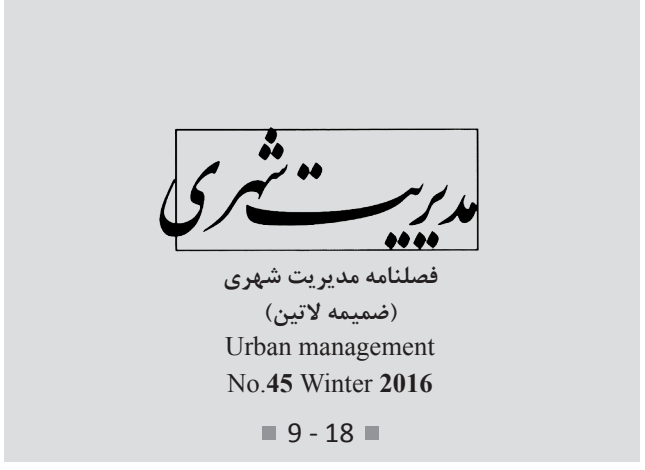
Received 23 May 2016; Accepted 11 Aug 2016