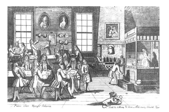
Pic 3. Coffeehouse in London, 17th century

houses including Shahnameh Khani, narration and painting on Iranian culture has been in such a way that most of illiterate individuals at that age memorized various verses of various poets. This is a point confessed by most of foreign tourists at that age, expressed that it can find the individuals in the most remote villages at Iran that they have not the knowledge for reading and writing, but they have memorized abundant poems such as Ferdowsi. These cultural traditions emerged at two important fields of narration and painting at coffee houses and both groups of narrators and painters have been among the street people who pursued the support from the people's beliefs and public religious thoughts in their works (Afshari, 2007, p.40).