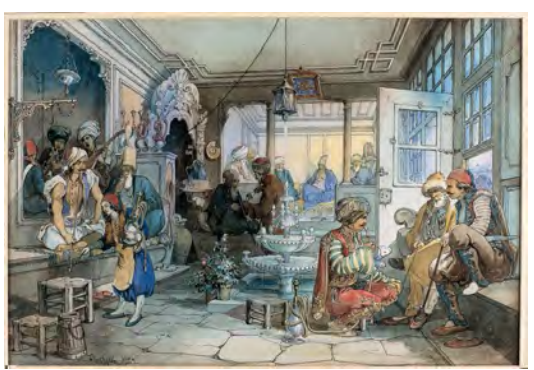
Pic 4. A café in Istanbul, 19th century

Painting: coffee house painting refreshby advent of conditional movement es and in line with public thought awakening and excellence of liberate thoughts all of sudden(Mohammad Azam zadeh, 1998, p. 109). Indeed, coffee house painting retrieved its semantic and structural basis when the old and autocratic intellectual system replaced with the democratic thought. Emergence of a painting style from the heat of coffee house indicates this dynamism. Under formation of conditionality event and public awakening of people as well as awareness from the situations going on the government, new conditions took place at the art and culture area; people of Iran who witnessed every day a new influence of Colonialism on one hand and domestic Authoritarian pressures on the