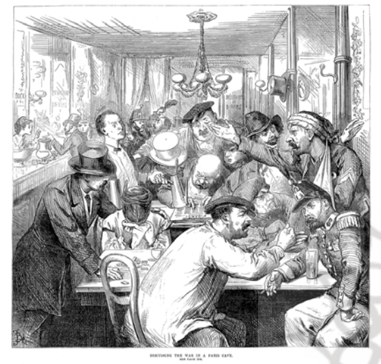
▲ Pic 1. Discussing the War in a Paris Café, the Illustrated London News 17 September 1870

conventionalizing people's gathering among various groups of people. In this regards, Habres like Walter Benjamin among the members of Frankfort school says that city not just economically has been the center of civil society but it has been in political-cultural contrast with court, caused growth and boom at public literary areas, i.e. an area which their major topic has been the topic over coffee houses and assemblies(Azad Aramaki, 2006, p. 28).