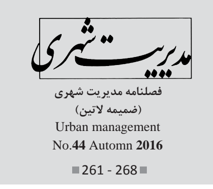
Received 23 Mar 2016; Accepted 11 July 2016