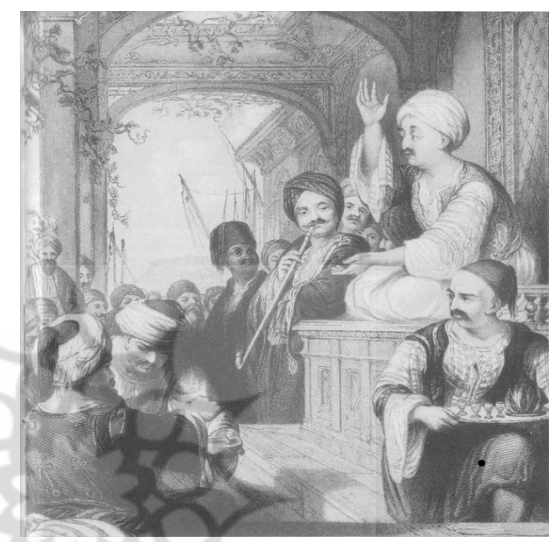
A Pic 2. Storyteller (meddah) at a coffeehouse in the Ottoman Empire

Coffee houses which have been the original social and cultural structures of the Iranians as well as the areas at Islamic world played a major role in creation of various norms. In the meantime, coffee houses had the major role in dissemination of original Iranian-Islamic cultures and generosity and chivalry foundations of various political, social and religious classes in Iran. Further coffee house had the major role in expansion of spiritual mood and