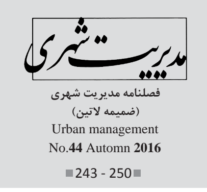
Received 14 Mar 2016; Accepted 11 Sep 2016