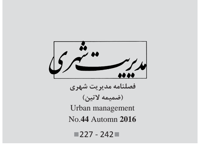
Received 12 Mar 2015; Accepted 11 Sep 2016