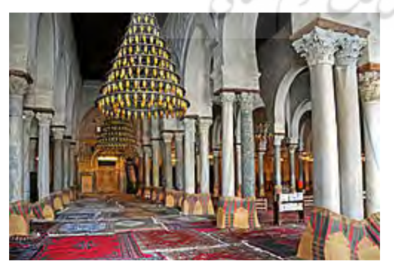
▲ Pic 3. The large Hypostyle prayer hall in the Great Mosque of Kairouan, dating in its present form from the 9th century, in Kairouan, Tunisia.