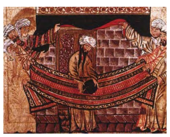
♠ Pic 7. In the center, Prophet Muhammad, with two long hair plaits, places the stone on a carpet held at the four corners by representatives of the four tribes, so that all have the honor of lifting it. The carpet is a kelim from Central Asia. Behind, two other men lift the black curtain which conceals the doors of the sanctuary.