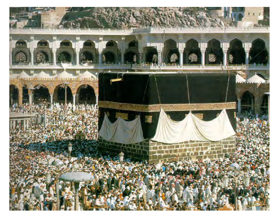
♠ Pic 8. Most of the year, the Kaaba is covered in black cloth. Beneath the black cloth is a stone building that may date back as far as 2030 B.C.E. Each side of the cube measures about 60 ft. across. There is a gold door in the southeast side. Inside, there is a polished marble floor and three pillars.

an octagonal displays a condition that it exits