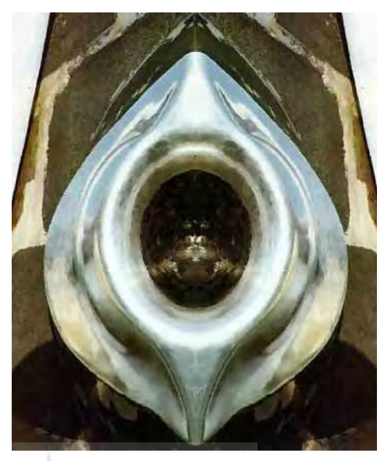
Pic 10. The Black Stone is a Muslim relic, which according to Islamic tradition dates back to the time of Adam and Eve. Historical research claims that the Black Stone marked the Kaaba as a place of worship during pre-Islamic pagan times.

Architecture in Islam has a great and important dignity and its purpose is the material crystallization of the revelation and reflexing