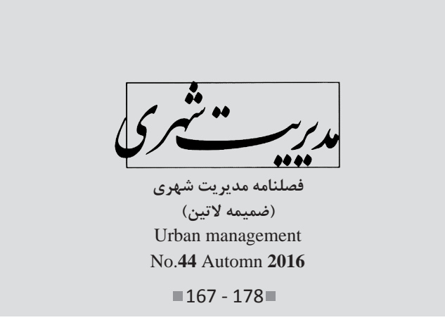
Received 27 Mar 2016; Accepted 11 July 2016