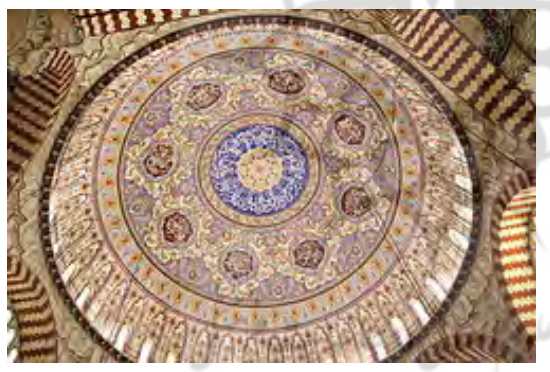
▲ Pic 1. The interior side view of the main dome of Selimiye Mosque in Edirne, Turkey.