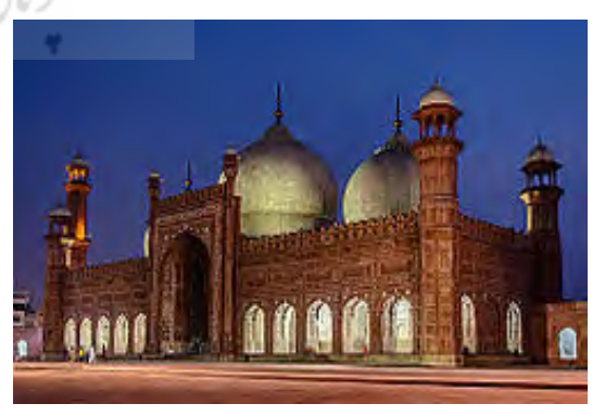
Pic 4. A view of the Badshahi Mosque in Lahore, Pakistan which was commissioned by the Mughal Emperor Aurangzeb in 1671