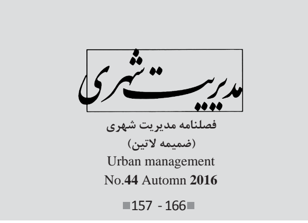
Received 13 Feb 2015; Accepted 11 May 2016