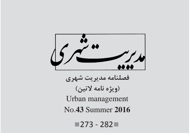
Received 12 Oct 2015; Accepted 2 Jan 2016