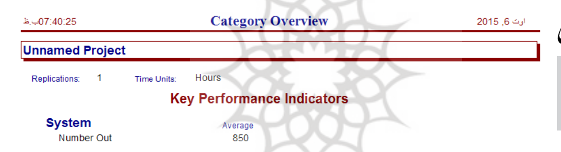
Report 1. Arena on the status quo-report number of production

Diag 2. Simulation of status quo by Arena software