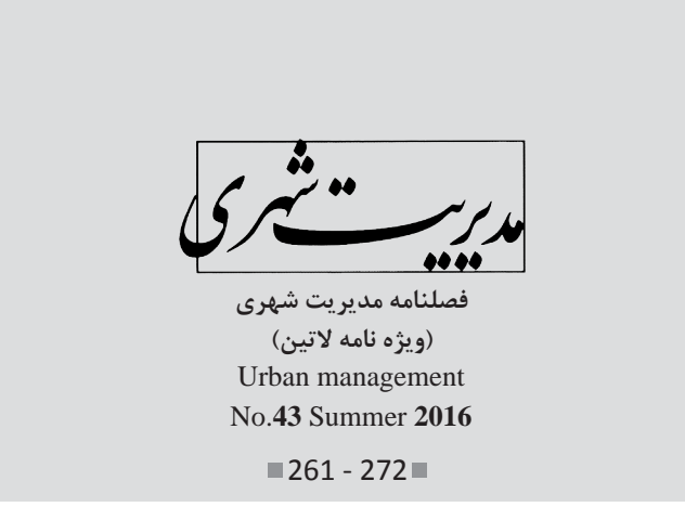
Received 12 Oct 2015; Accepted 2 Jan 2016