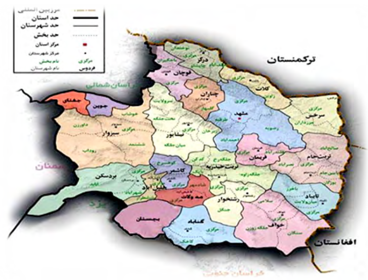
▲ Map 1. Neighborhood of Khorasan province with neighboring countries; (Source: www.khrorc.ir)