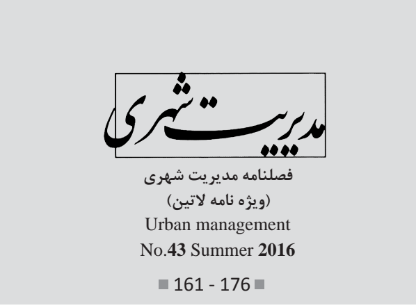
Received 12 Oct 2015; Accepted 2 Jan 2016