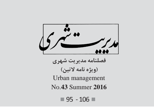
Received 12 Oct 2015; Accepted 2 Jan 2016