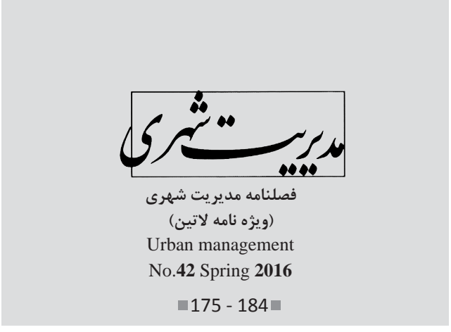
Received 15 Sep 2015; Accepted 1 Feb 2016