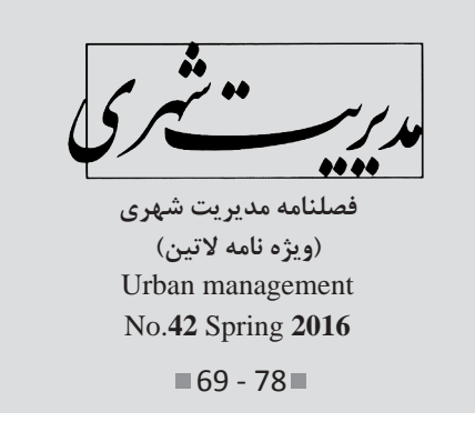
Received 14 Apr 2015; Accepted 8 Mar 2016