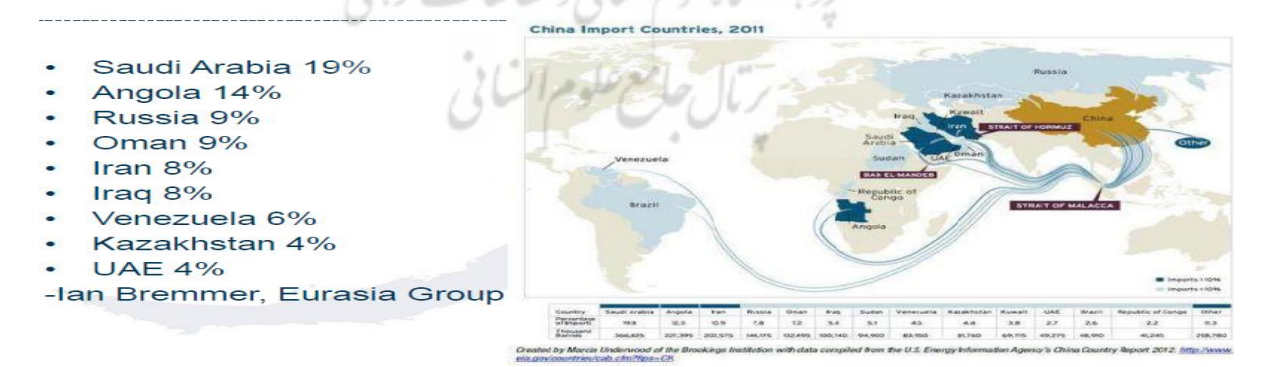
Figure 4: Eighty percent of China's oil imports in 2011 came from the Straits of Malacca, mostly from West Asia