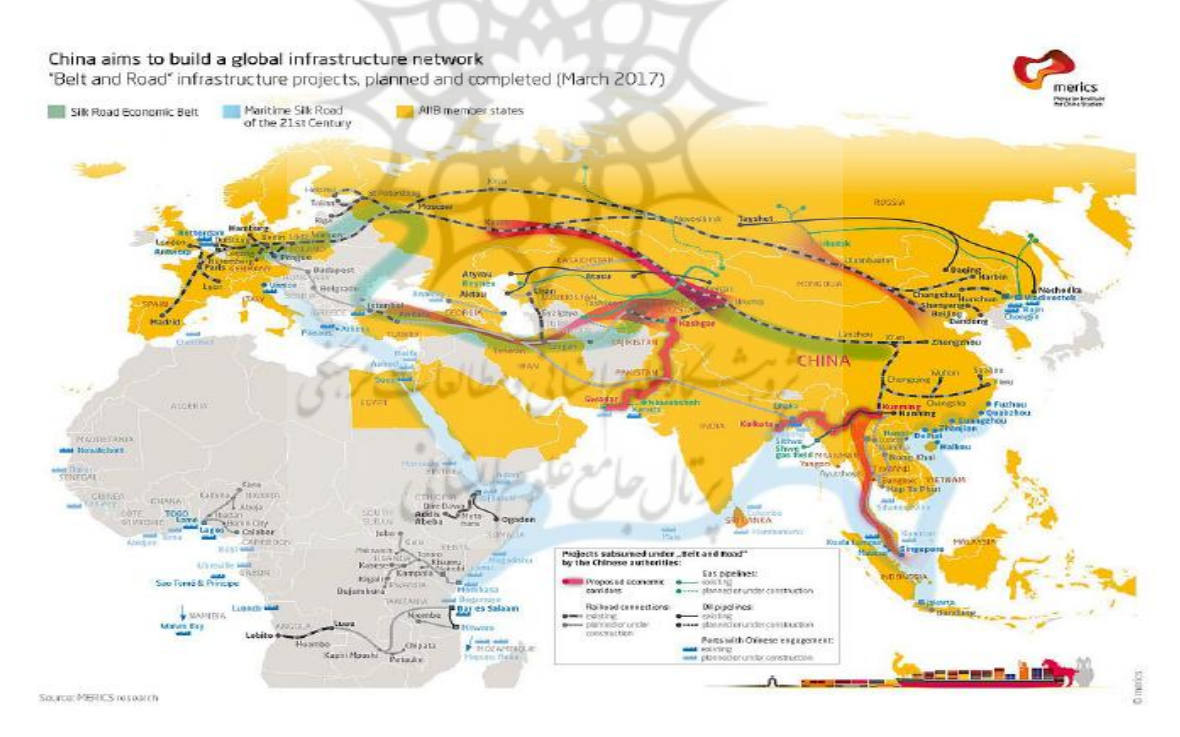
Figure 5: Iran in the proposed routes of economic corridors in 2017

have a positive impact on the Iranian economy in the short term. If Iran joins the China Road Belt Initiative, China could reach Syria via Iran, Iraq, and eventually the Mediterranean. This frees China from the siege of the United States and the eastern Mediterranean, because the Mediterranean is a big market. Iran's advantage is that China can invest in Iran and use Iran's economic transformation and cheap labor to quickly bring Chinese goods to the Mediterranean market. At the same time, it also creates job opportunities for Iran, increases Iran's GDP, and improves Iran's position in Southwest Asia, which opens a new path for Iran. The China Belt-Road Initiative can be extended east-west from China to Iran and then west and Europe through the following proposed routes: