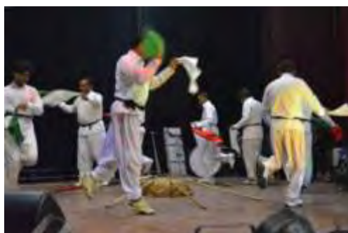
Figure 5. Folk dance in southern Kerman