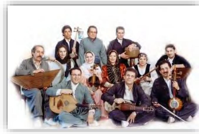
Figure 3. Kamkar's group and Iranian musical instruments