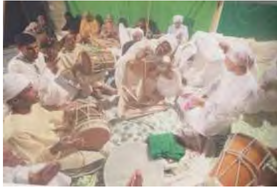
Figure 6. The zar ceremony in southern Iran

are brought from other countries to Iran to use music therapy programs and benefit from its benefits in terms of tourism development.