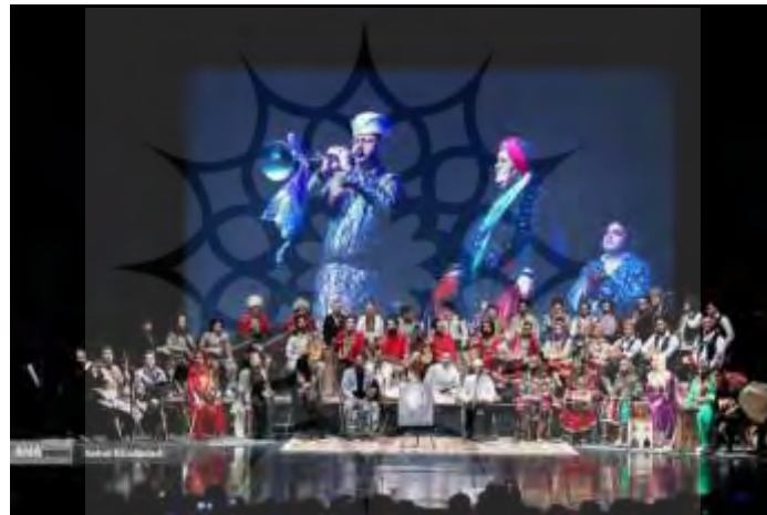
Figure 4. Folk music orchestra

As can be observed, the instruments used in Iranian music are of great variety, and each is used with a specific sound color in a solo group. In addition to the sound characteristics, Iranian musical instruments, as part of Iranian handicrafts, also have significant visual beauty. These features can provide many attractions for music audiences and attract many national and foreign tourists to different regions of Iran.