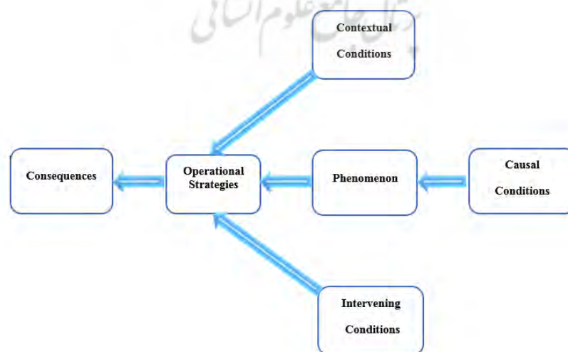
Figure 1. Strauss and Carbin paradigm model (Cresswell, 2012)