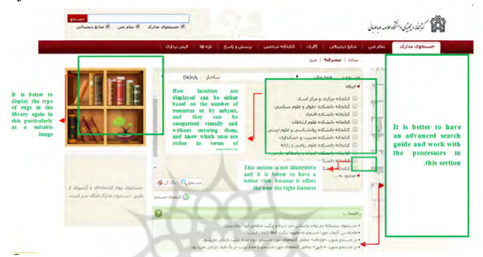
Figure 5- The proposed pattern of the digital library search page of Allameh Tabataba'i University

considered to place the guiding or guide elements so that the user can quickly and easily access the desired sections. They have this section, but they have forgotten which part it is located, to have a reminder, and for those who do not need to study this reminder, it can be rejected.