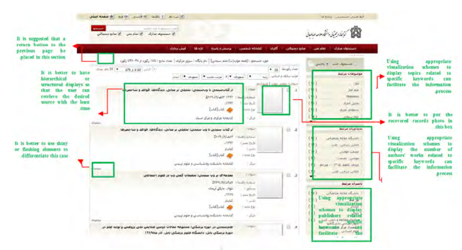
Figure 6- The proposed pattern of findings page of the Digital Library of Allameh Tabataba'i University