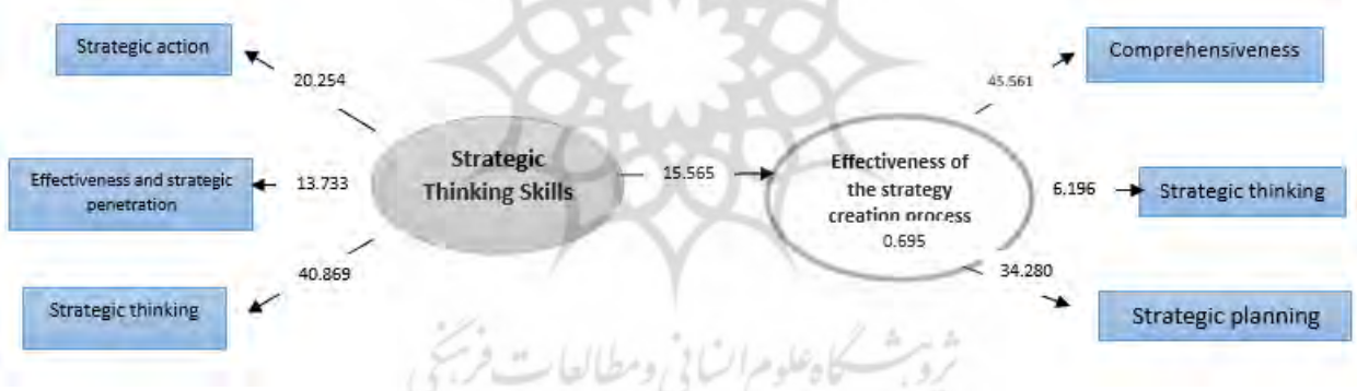
Figure 3. t-value of the casual path

T-value: The first and most basic criterion for assessing the fitness of the structural model is the t-value, which must be greater than 1.96 to confirm the casual path. Figure 3 shows the t-value of the research paths.