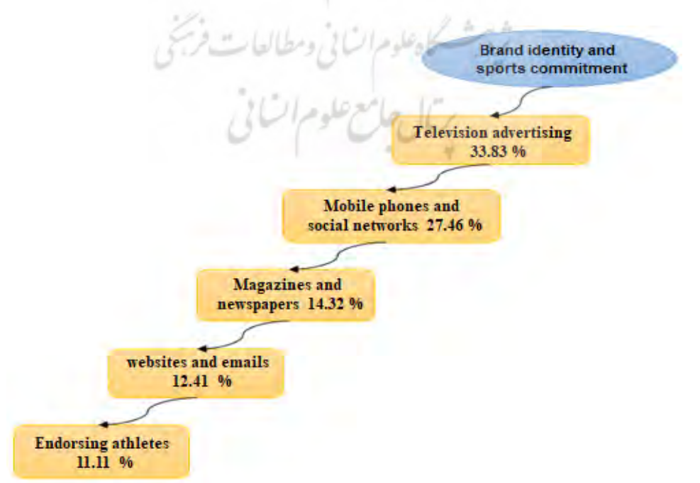
Figure 3. A mixed model of the use of promotional and advertising tools based on the priority of the effectiveness of each tool

Figure 3 shows an integrated application model of the use of promotional and advertising tools to effectively convey brand identity and sports commitment to consumers (based on research findings) and the impact of each tool: