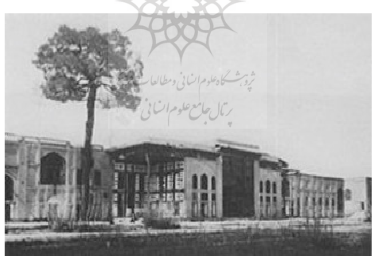
Fig. 1: A view of Haft Dast Palace before destruction (Holetzer 1930: 131).

On the other hand, in the 11 and 12<sup>th</sup> centuries of A.D., two powerful political and religious families were founded in Isfahan, Al Khanjad and Al Sa'id, with two religious' tendencies, Shafi'i and Hanafi. They ruled this city for They had a bigoted spirit, which is why many religious conflicts arose in this city and caused many killings and destructions (Kasaei, 1979: 976; Kajbaf, 2006: 19). In the year 1181 A.D., there were terrible wars for eight days between Sadr al-Din Abdul Latif, son of Abu Bakr Khanjadi and other religious leaders. In these conflicts, many people were killed, and many houses and markets of Isfahan were burned and destroyed (Ibn Athir, 1965: 319). Religious differences and conflicts continued in Isfahan in different periods and were not unique to a particular period. As Ibn Battuta, a traveler in the 14<sup>th</sup> century after visiting the city of Isfahan, although he described it as large and beautiful, he pointed to the destruction of many parts of the city. Isfahan and its buildings considered this to be the result of differences between the Sunnis and Shiites of this city (Ibn Batuta, 1991: 246). Although there are many reports about religious conflicts in Isfahan (Nasvi, 1965: Notes 219 and 316), in a few of them, in addition to explaining the disputes, they have mentioned the destroyed buildings (Banakti, 1969: 365; Khafi, 1962: 254, 1965, Vol. 1: 296).