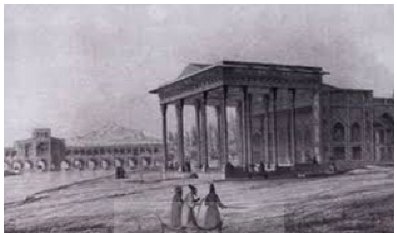
Fig. 2: The Ayeneh khaneh image before the destruction (1936: 256).