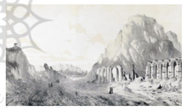
Fig. 4: The ruins of Farah Abad Palace (Flanden 1936: 244).

Among the disputes within the government and when a person holding an office and having power was subjected to royal wrath after killing the person in question, the buildings built by him were destroyed to destroy any evidence of his presence. An example of this work regarding Sarutoghi, the chancellor of Shah Abbas II, can be seen that according to historical evidence, after his murder, his palace, which is described as one of the most beautiful palaces in Isfahan, fell into ruins. After a while, it was used as Darugheh's residence by the Shah's order due to the usurpation of the place, he preferred to build a home and works for himself next to the ruined buildings (Chardin, 2000: 24). It is true about the change of use of Jarchibashi Palace, which Shah Abbas angered, and after the seizure of his property, his palace was handed over to its representatives at the request of the British Company for this country's trade house. This was even though they were destroyed after a few decades and the decline of their business. According to reports, the paintings, gilding, elaborate ceiling decorations, doors, and walls were lost (Ibid).