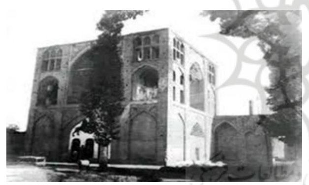
Fig. 3: Jahan Nama Palace by Joseph Papazian in Golestan Palace photo album (Shojaei Isfahani 2016: 38).