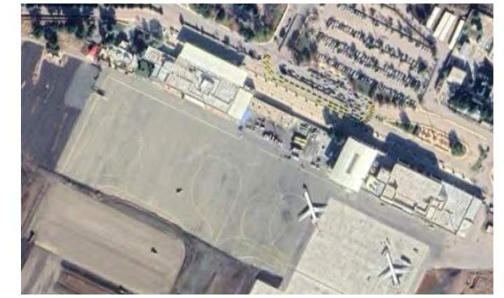
Fig. 3: The aerial photo of Kermanshah International Airport

largest airport and hub in the western part of the country, the runway length of this airport is 3400 meters, and the parking space of its airlines is 38200 square meters. The primary design of Kermanshah Airport dates back to 1970. However, it was put into operation in 1995. This airport currently has two terminals and is the busiest airport in the country's west, handling about three million people a year. One of the two terminals of this airport is for foreign flights and the other, which has a new building, is for domestic flights. The international flight terminal, with an area of about 5000 square meters, has been built on two floors. The first floor is dedicated to passenger services and the other to administrative affairs. The new terminal has been built in the same area as the international flight terminal. A special passenger section (V.I.P and C.I.P) has also been designed and built in this building. The incoming flight section (arrivals) in the new terminal is built in a separate building and adjacent to the terminal. The airport terminal building has all the necessary international standards, including free shops, bank branches, restaurants, and buffets. The aerial photo of Kermanshah International Airport is shown in Figure 3. According to the airport's statistical population and Cochran's formula, 384 questionnaires were completed randomly in the terminal.