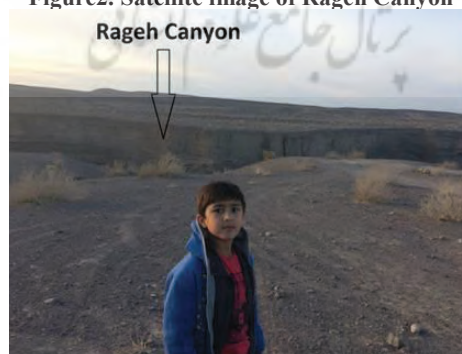
Figure3. Most of the canyon is in a flat plain