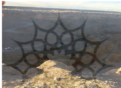
Figure 5. View of a road to reach down of Canyon for tourists.