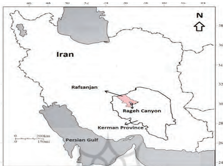
Figure1. Rageh Canyon is located in the southeast of Rafsanjān in Kerman province