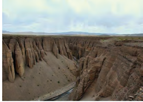
Figure 4. beautiful shape in the walls of the Rageh Canyon