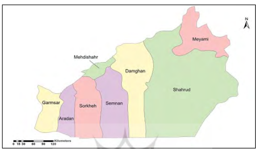
Map 2- city position of Garmsar in Semnan province

Evaluation of city of Garmsar which earned third place in comparison to other cities, suggests that city of Garmsar in the education sector ranked first, in the arts and culture, health, agriculture and mining industry ranked second, third place in urban development and in population and employment, rural development and transport and communications is ranked fourth.