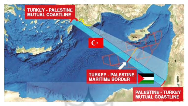
Figure (4): Proposed Turkey-Palestine Maritime Delimitation