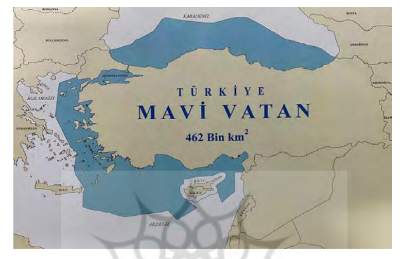
Figure (5): "Mavi Vatan" (Blue Homeland) of Turkey