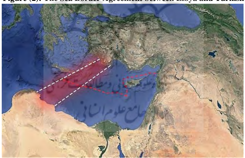
Figure (2): The Sea Border Agreement between Libya and Turkish

In 2019, as it is shown below, Turkey signed a treaty to delimit of sea border with the Libyan government in Tripoli. Following the agreement, Turkey increased its military level with the Libyan central government by sending advanced engineering forces and military equipment, after which the central government defeated Russia and France's backed General Khalifa Haftar's rebel forces.