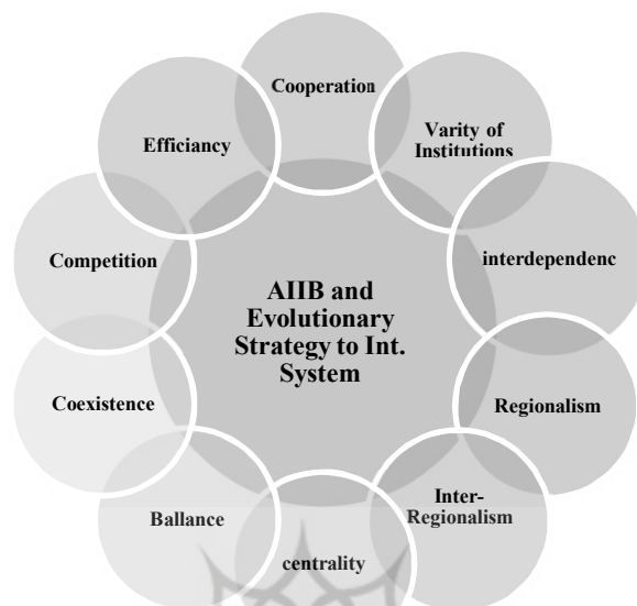
Figure 2: The Second Sub-Systemic Image: The AIIB As a new-born Centrality (for China) and Systemic Evolution