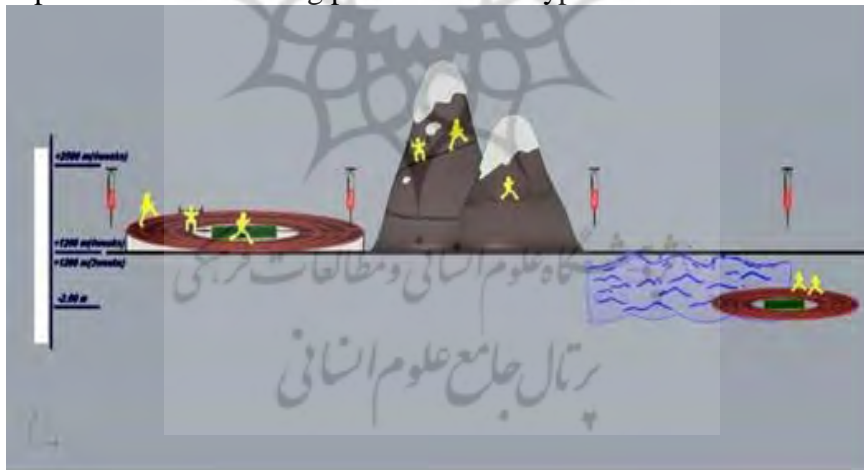
Fig 1: Components of Training Protocol under Hypoxic and Normoxic States

The runners were provided with equal accommodation, resting and exercises facilities. The trainings were based on two methods of “living high, training low” (LHTL) and “living high, training high” (LHTH). The results of 3000-meter running performance and information related to the samples are given in Table 2 and 3. Figure 1 contains the components of the training protocol under hypoxic and normoxic states.