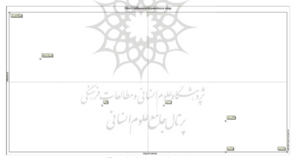
Figure 1. MicMac analysis result

factors with weak and moderate influence on power and dependence. Dependent factors have low influence power but relatively high dependence. These factors are usually targeted or result variables. Linking factors have high guiding power and dependence; influential factors have a high level of influence but low dependence (Malon, 2014).