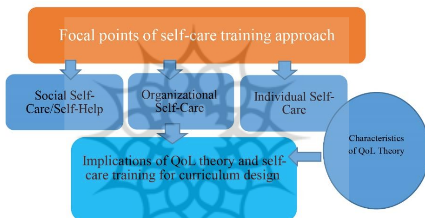
Figure 1. Characteristics of self-care training curriculum design logic

According to Akker's model (2), the logic of designing a self-care training curriculum for Red Crescent relief workers is presented by considering the focus of the self-care training approach and the characteristics of quality of life (QoL) theory. Therefore, the design of the curriculum is inevitably based on the focal points of the self-care training approach, which is presented below