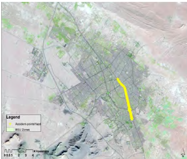
Figure 1. Map of Yazd and the study area

route, spatial units, and location map of important offices and centers in the study area are presented in Figures 1-3.