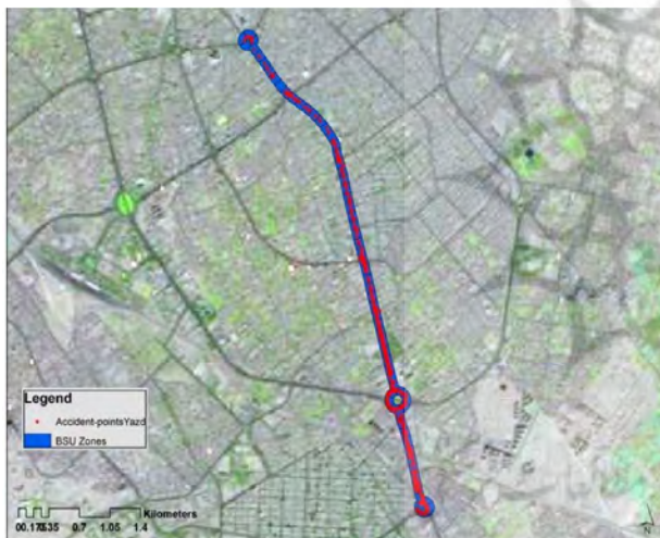
Figure 2. Selected route map and scattering of events

Zoning of spatial units based on the accident rate-severity index: A total of 66 spatial units were examined in the present study. After quantifying the accident risk by the accident rate-severity method, 41(62.1%) spatial units (4,100 meters) were identified as Cold Zones, and 19 (28.8%) spatial units were identified as Yellow Zone (1900 m). These spatial units are potential accident hotspots and they should be given the second priority after accident hotspots. Finally, 6 space units (600 meters) were identified as Hot Zones (9.1%) (Table 2) (Figure 4).