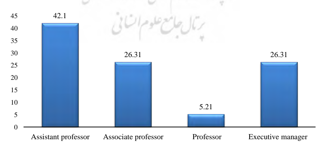
Figure 1. Academic rank and organizational positions of research participants