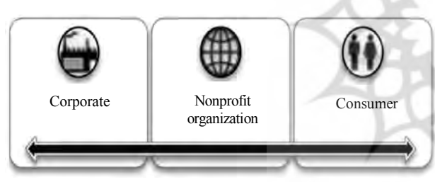
Figure 1. Scope of cause-related marketing (CRM) beneficiaries

societies is known as cause-related marketing (CRM) in which the nonprofit organizations collaborate with the corporations through access to new sources of fundraising and increasing social participation to benefit from the cooperation advantages. The popularity of this marketing tool is nowadays evident in the level of the involvement of corporates in social causes as it grew by 3.6% in the United States in 2017 and a total of 2.06 billion dollars has been dedicated for it (2). The term CRM was first coined in the 1980s and refers to campaigns where a corporate works with a nonprofit organization to help a particular social cause, whether through product sales or product use (3). In fact, CRM is a marketing tool that can be used to achieve a wide range of goals (4). Numerous studies have indicated that the emergence of CRM has increased the scope and breadth of the organization's beneficiaries beyond consumers and by integrating it with the nonprofit sectors (Figure 1), especially the sectors with knowledge and progress dealing with the social field for the improvement of social causes, such as human rights or sustainable development (5).