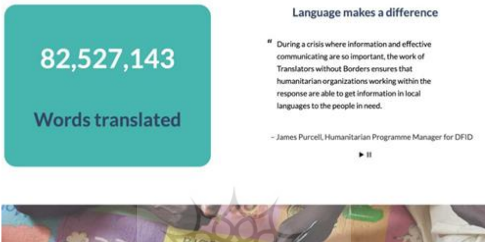
Figure 3: Words Translated Counter on TWB’s Homepage (accessed 25 October 2019)

and projects; its website states that it “translates more than ten million words per year for non-profit organizations”.