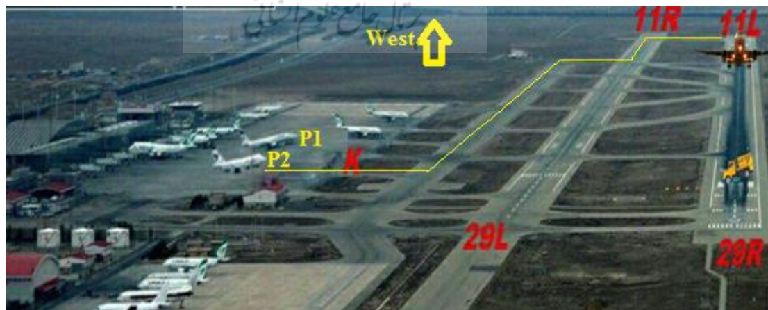
Figure2. Imam Khomeini Airport

In the other case, the headset man was told by the pilot to inform the pushback driver to move the plane to east (face east). Due to the accent of the foreign pilot, the headset man could not discern which direction the pilot requested. He passed the message wrongly to pushback driver and the plane was moved to the opposite direction. Later on, he proclaimed that he didn't recognized which direction the pilot said but he didn't ask for clarification. In this respect, maxim of quality has been violated in part of the headset man since he did not pass the message truly and therefore, miscommunication occurred.