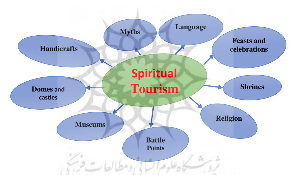
Fig. 3. Important factors in the creation of tourism spirituality

At the end of the research and in the following figure, the important elements that have played role in the creation of tourism and spirituality, followed by the development of peace on a variety of scales are pointed out as follows: