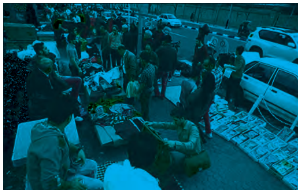
Fig. 1: street entertainer at a pedestrian mall in Vali Asr s.t, Tehran draws attention from passers-by

The popular notion that public space is a stage, and that there is an audience watching is reminiscent of Shakespearean times. Not unlike Shakespeare, French (1978), Whyte (1988), Carr et al. (1992), Engwicht (1999) and more recently Cousseran (2006) also describe public spaces as theatrical stage-like settings. This notion is based on the idea that public spaces by their very nature allow for the unfolding of real-life human dramas and the freedom of personal and social expression for both individuals and community groups, such as that which is depicted in (Figure 1) below (French, 1978; Whyte, 1988; Carr