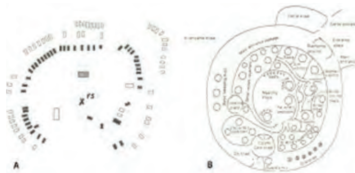
Fig. 2: Plan of an Omarakana village depicting the public space at the centre, and B) plan of the Ambo people's settlement depicting the Meeting Place also at the centre (Source: Lawrence, 1989).

Built environment professionals and public authorities, particularly local councils, recognize that public spaces are significant. They understand that creating attractive, well-designed and maintained spaces that provide a variety of opportunities for users can promote a sense of community as well as generate economic benefits. When these figures