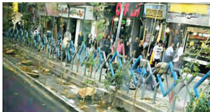
Fig. 4: Examples of environmental stimuli in the streets of Vli Asr s.t in the form of buildings, streets, buses, signs, colours, signs, images and other people

When attempts to regain control of the environment are unsuccessful, learned helplessness can develop (Gifford, 2002; Veitch & Arkkelin, 1995). This is where people begin to believe that what they do has no effect on the environment and that whatever happens is out of their control. This can result in a sense of despair and feelings of alienation about the environment. In contrast, when people perceive that they have some control over their environment, it has been found that environmental problems such as littering and graffiti are