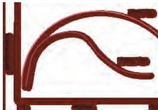
Fig. 3: Yerkes Dodson Law – arousal above the optimal leads to decrements in performance.

Arousal theories relate to how psychologically aroused people are as a result of environmental stimulation. Bell et al. (1996) explain that “arousal is a heightening of brain activity by the arousal center of the brain, known as the reticular formation” (Bell et al, 1996). It is characterised on a scale which features