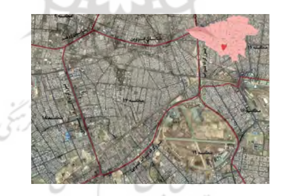
Fig. 2: Position of district 17

with an area of 8-22 million acres, accounts for about 15-1% of Tehran's total area. The neighboring regions: from north and northwest: regions 9 and 10, from the south: from the 19th, from the east: from the 16th and 17th, from the west: the 18th district, the districts and the neighborhoods; the area 1: the Yaft Abad, the western Abuzar, Azari, Imamzadeh Hasan; District 2: Zayebi, Wassafnard, Jalili, Golchin, Sajjad, Zamzam; District 3: Moghadam, East Aboozar, Khazaneh Garden, Boloor Sazi (Tehran Tourist Guide- Tehran Municipality- District 17).