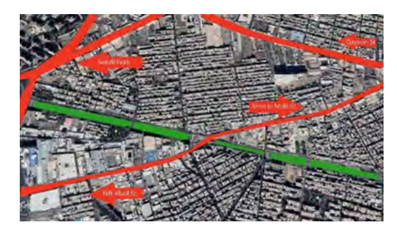
Fig.3: Tehran-Tabriz railway in green

The project aims to redeem the brownfields of the Tehran-Tabriz railway line and improve the neighborhood situation, connect the north and south sides of the street, ease the flow of people and increase social communication through building a linear park or green pedestrian has been defined (Fig. 3).