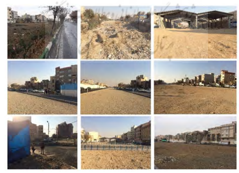
Fig. 4: Photos of the five studied zones

By using Kolmogorov-Smirnov test, the normal variables were studied. Given that the P-value of most components is less than 0.05, we consider the distribution of data as abnormal, and therefore nonparametric tests are used to test the statistical assumptions. The results of the binary test on the interest of people in converting unpolluted land into the park show that people are interested in turning unpolluted land into parks and showing the impact of park creation on surrounding areas. Creating a park will have an impact on surrounding uses and will increase their revenue. Also, the results of the bimonthly test on the impact of park creation on the quality of life of people in the neighborhood, such as vitality, development of mental health and health, improvement of social relationships, etc., have been shown to improve the living conditions of individuals. In relation to the benchmarks, the binomial test shows that the people of the neighborhood agreed with the cases considered. The questionnaire for cycling and alabaster