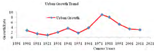
Fig. 1: Trend of urbanization in Bangladesh (1891-2001) (Source: Table 1)