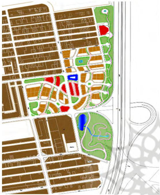
Fig. 7: The third alternative of urban design.

walkway; Create two strong passages between common centers and cultural hill as an eminent element and put homogenous landmarks on top of them; Do not cross the place front of house, for more calm by make loops and dead end turns; Establish galleries and cultural exhibitions in the hill for more useful of this distinctive element.