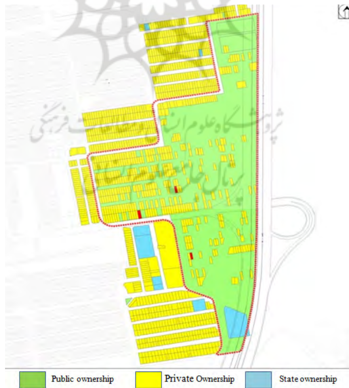
Fig. 4: Proportion of land ownership in the site.

Beside environmental pollution problems and social abnormality, the site is encounter to a legal limitation. In fact, as it mentioned before, these lands are located on the edge of the city and some of them had been situated outside of the city and were abandoned, but after providing a new urban development plan, they are settled inside of the city with complicated urban marginal features and a lot of titleholder who are waiting for years to build their lands. For example the owners of 300 land parcels obtained verdict from the "Court of Administrative Justice" Fortunately municipality acquired 75% of lands (Armansher Consulting Engineers, 2010b) (Fig. 4) but many