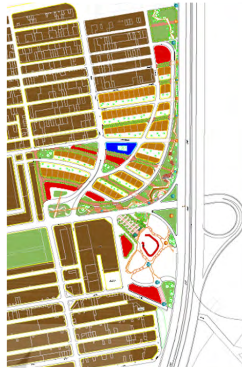
Fig. 5: The first alternative of urban design.