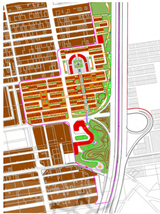
Fig. 12: Accepted alternative of urban design.