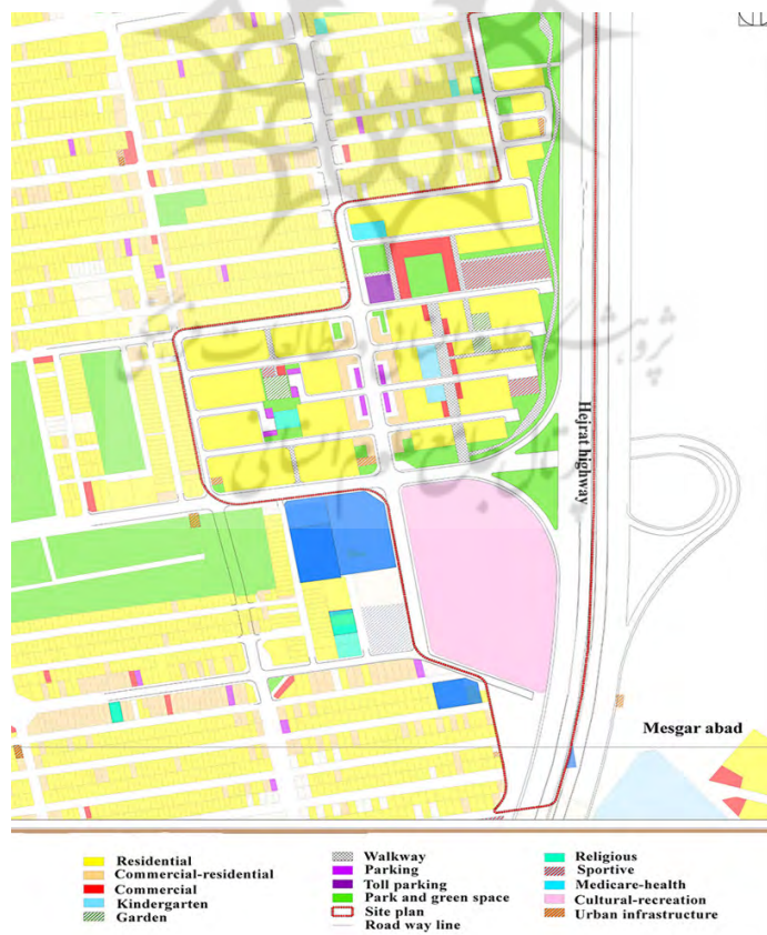
Fig. 13: Land use plan proposed.