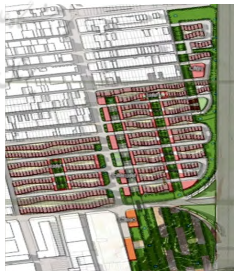
Fig. 9: The sixth alternative of urban design.

In the sixth scenario, some parameters like as regard to