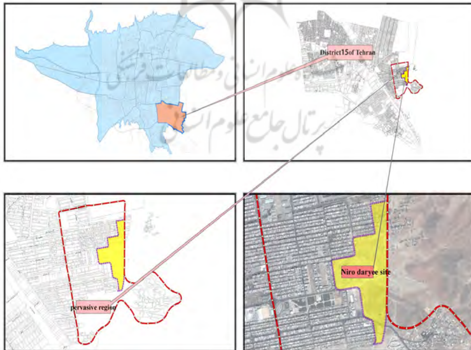
Fig. 1: Location of Niroo Darysee site in Tehran city.

In topographical aspect, it is very differences. Existence the hill