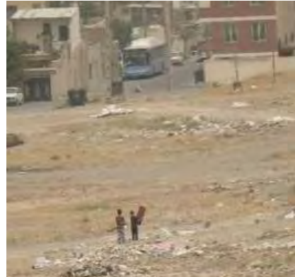
Fig. 3: Abandon land in the site.

Beside environmental pollution problems and social abnormality, the site is encounter to a legal limitation. In fact, as it mentioned before, these lands are located on the edge of the city and some of them had been situated outside of the city and were abandoned, but after providing a new urban development plan, they are settled inside of the city with complicated urban marginal features and a lot of titleholder who are waiting for years to build their lands. For example the owners of 300 land parcels obtained verdict from the "Court of Administrative Justice" Fortunately municipality acquired 75% of lands (Armansher Consulting Engineers, 2010b) (Fig. 4) but many