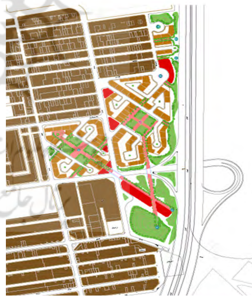
Fig. 6: The second alternative of urban design.

The second scenario supported common centres, plazas and neighbourhood settlements and follows these features: Central Plaza (according to the strategic plan); Settle blocks like as a loop around each neighbourhood, cause more calm and forbidden vehicle's traffic to accesses of residential units;