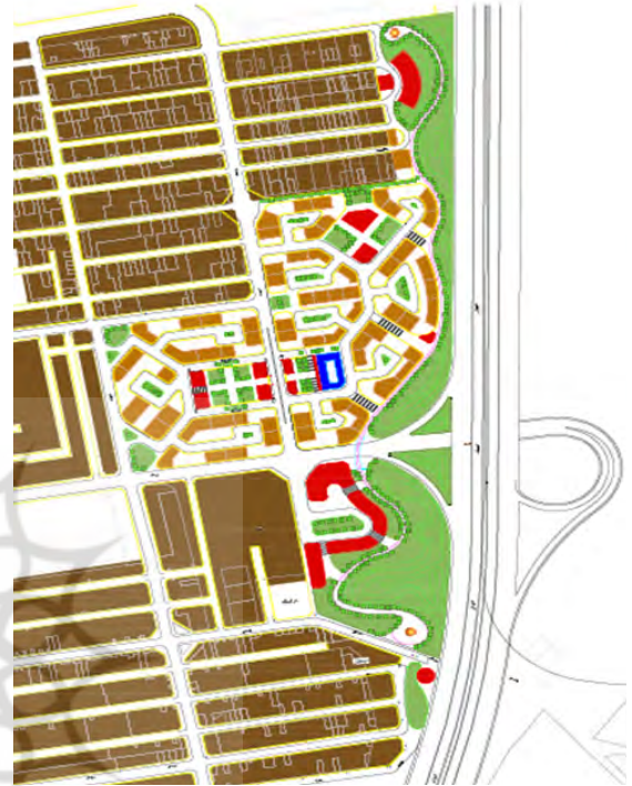
Fig. 8: The fourth alternative of urban design.

In the third scenario link and coordinate to nature is a main criteria of design. Hence topographic lines, conserving and development of nature's elements were important leading factors to an organic design. So this scenario includes the following features: