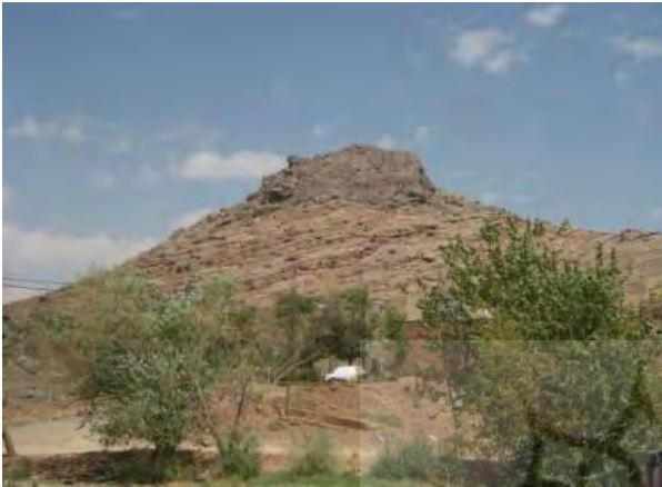
Fig. 2: Hill in the south of site.

in the south of site, create a nice view, as the mountain in north of the city is completely clear. (Fig. 2) However about 80 percent of lands are abandoned, thus they have made many social and environmental problems (Fig. 3) several fires happen in it, commit a crime and inner quarrels occur on it and cause to be insecure and create undefended spaces especially for children and old people. In fact, this site is a kind of urban fringe with all social and economic side effects.