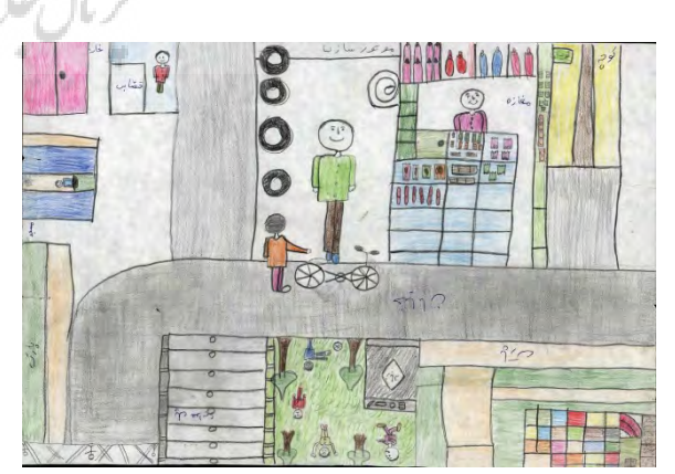
Fig. 3: A child drawing "a good city: a neighborhood without cars"