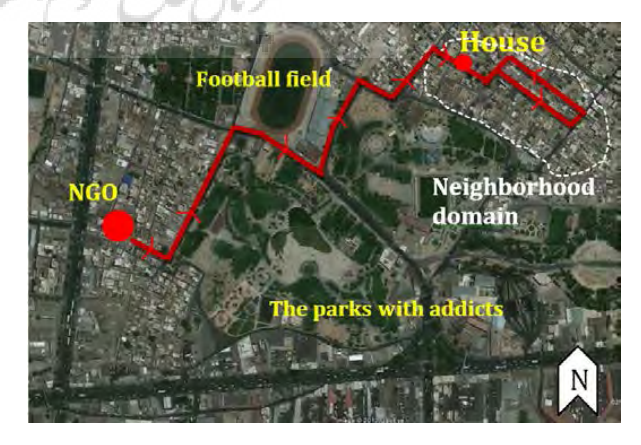
Fig. 5: The track of inspection in theDarvazeh-Ghar.