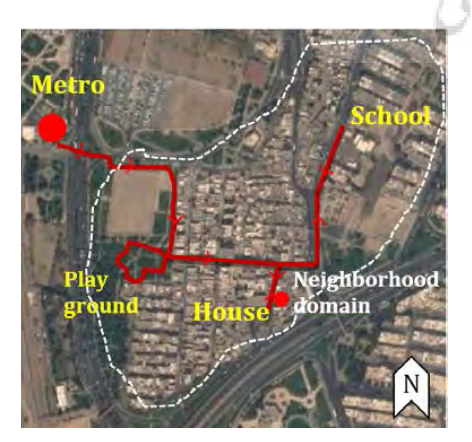
Fig. 4: The track of inspection in the Javanmard-Ghassab.

This method requires spending relatively significant amounts of time as it needs preparing and gaining the children's trust in order to achieve the desired outcome. In addition, the coordination of times and site visits with children takes much time. Walking through the meeting neighborhood, there are side elements that reduce the children's focus, however, like interviews, this method raises the feeling of being