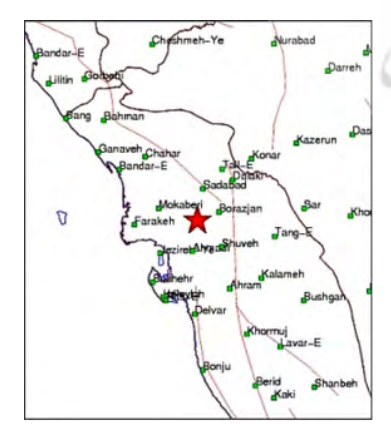
Fig. 1: Location of Borazjan city in Bousher province

Table 1 shows that according to the results of Cranach's alpha