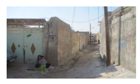
Fig. 3 and 4: Physical erosion in deteriorated areas of Borazjan

the coefficient of internal consistency of questions of this research questionnaire is 0.740.