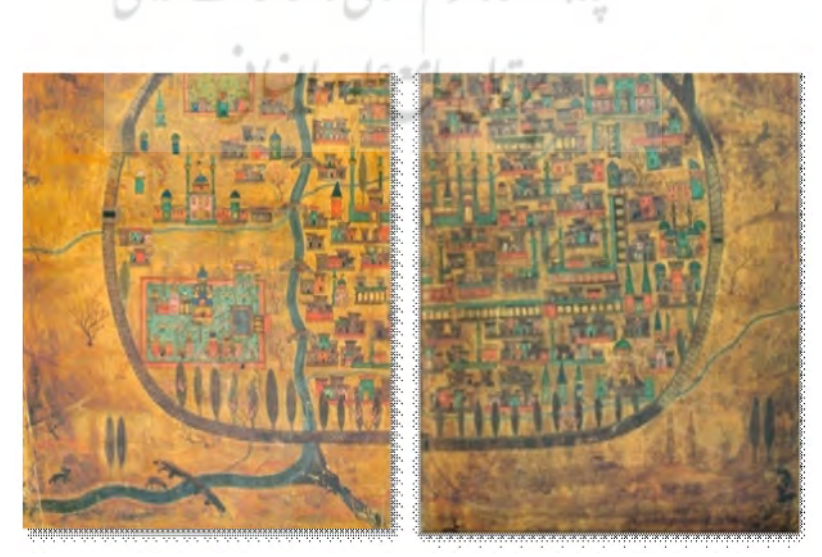
Fig. 1: Tabriz miniature drawn by Nasuh in 1536 AD

According to Albert Gabriel, the analysis of the structure of Istanbul shows that these images can be used as city maps which in addition to the information on the topography; reflect the architecture type from Ottoman view. The image analysis also helps in determining the internal structure of cities according to contemporary methods (Kosebay, 1996). Walter Denni, an American researcher, studied the details of the Istanbul's map written by Nasuh. The title of his study is "The Architecture of Istanbul in the sixteenth century". In this work, the researcher attempted to compare the illustrated buildings with the existing reality. According to him, some tombs, especially those located in large cities, from the viewpoint of architecture and topography are consistent with reality. Among them, however, some are similar to each other and copied each other. He has completed the list produced by Gabriel through indicating the possible similarity of 121 locations which has been numbered by him. Thus, the images of Istanbul, Diyarbakir,