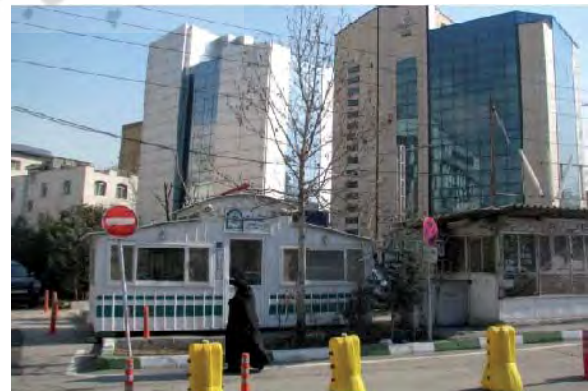
Fig. 2: A walkway with low level security (Chizar, northern corner of Neda Square, spring 2011)