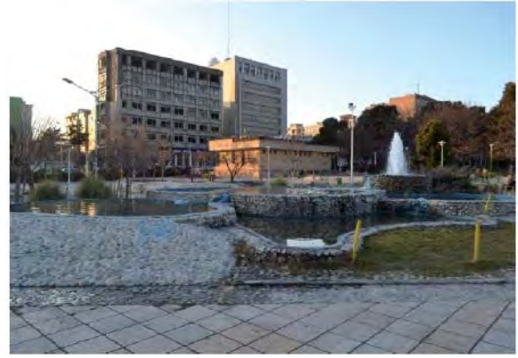
Fig. 4: Lively and dynamic, attractive, safe, and flexible walkway, Laleh Park, Winter 2011

Using combined functions for security and comfort of the pedestrians at all the times.