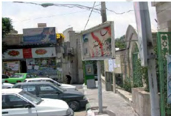
Fig. 1: Discontinuity of the walkway (Chizar, entrance of the Aliakbar shrine, spring 2011)