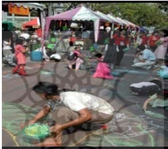
Fig. 9: Creating a Fresh and Live Walkways using Art Street, Bangkok.