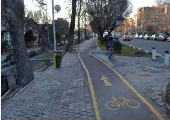
Fig. 3: Safe and lively walkway with standard pavement, Keshavarz Blvd., Southern corner of the Laleh park, Winter 2011.