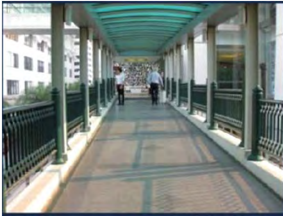
Fig. 7: Skyway to Facilitate Walking for Pedestrians and Reducing Traffic, Bangkok.