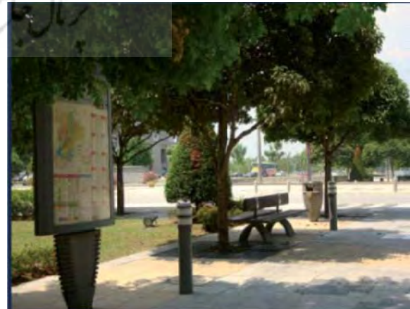
Fig. 6: Direction Signs on Walkways, Potrajaya