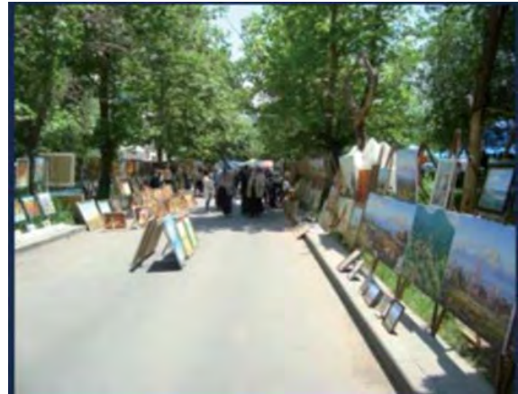
Fig. 8: Creating Attraction in the Walkway Using Art works, Armenia, Yerevan.