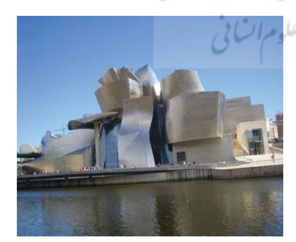
Fig. 1: Main view of Guggenheim Museum

"The Hyatt Regency Hotel is located in Birmingham across Broad Street from the International Convention Centre. The impact of the hotel on the International Convention Centre was to reinforce its credibility in the market, thus reinforcing its flagship function. The Hyatt has had a positive role as a flagship in attracting further investment in its wake in the Broad Street area and in the hotel sector. It has added to the image of Birmingham as a vital city, second only to London. In other words, it has added to the efforts to reposition the area and city as having service international orientation. The Copthorne Hotel, another glass design, is located close to Paradise Forum at the other end of Centenary Square, which is the main public space between the ICC and Hyatt and the city centre" (Smyth, 1994,159)