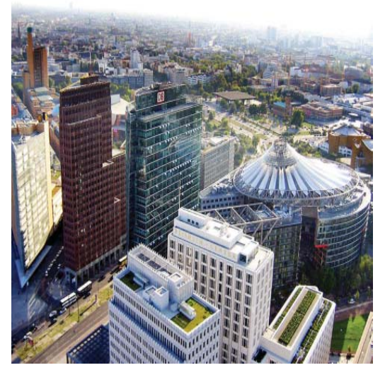
Fig. 3: Aerial view of Potsdamer Platz