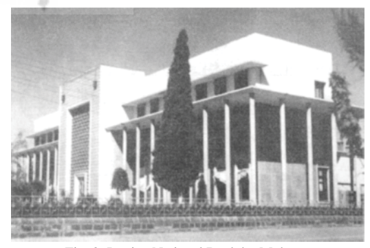
Fig. 2: Iranian National Bank by Mohsen Foroughi, Shiraz