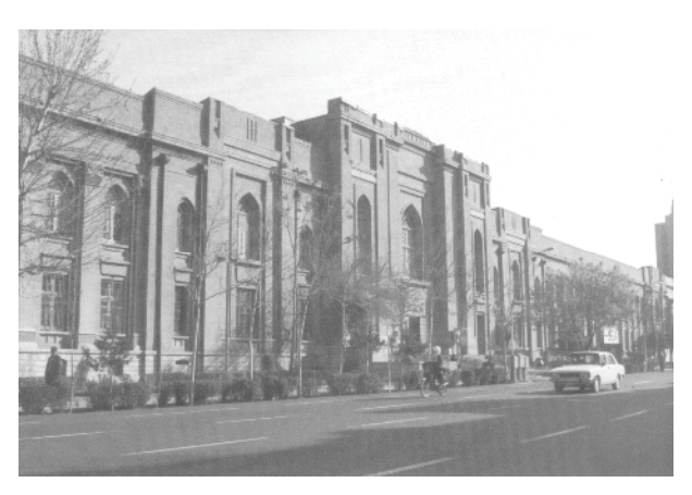
Fig. 4: Central Post office, by Nicholai Markov Tehran, 1934

Only features of pre-Islamic architecture were considered. Columns, Column capitals, stairs and ornamental designs and so on were borrowed from Sassanid and Hakhamanid eras. of course, respecting the necessity of devising new functions there was no need for considering the pre-Islamic pattern of