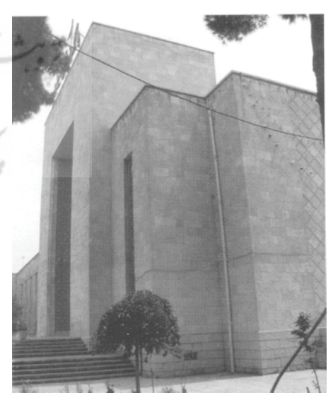
Fig. 8: Isfahan National Bank, by Mohsen Foroughi,1942