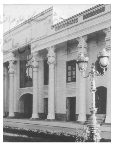
Fig. 6: North side of National consultative Assembly by Karim Taherzadeh Behzad, Tehran,1936